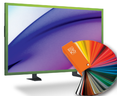
Customised housing colours possible