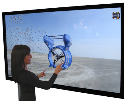
Optional with touch surface