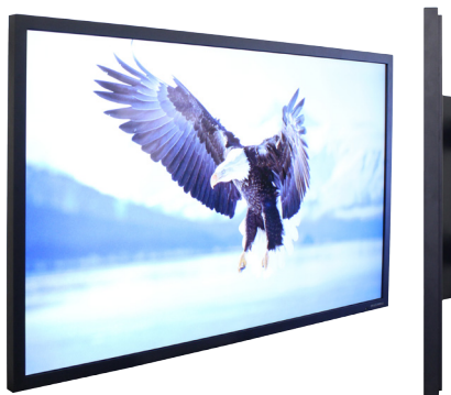
Robust & slim design